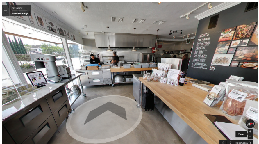
Business View of ‘Just Food For Dogs’ open kitchen in Newport Beach, California